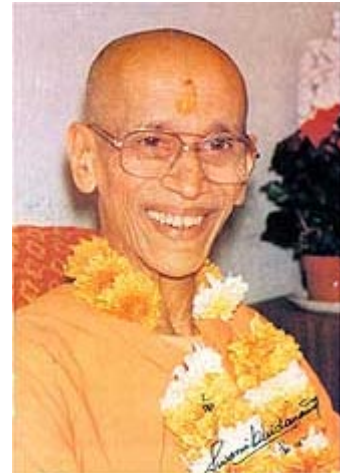
Sri Swami Chidananda

SERVE, LOVE, GIVE, PURIFY, MEDITATE, REALIZE So Says Sri Swami Sivananda